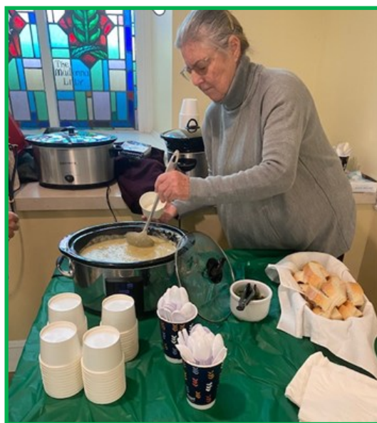
St. Brigid Mass February 8, 2025 at St Peter Church, Danbury CT with baked goods, soup, a talk about St Brigid and a craft (making St Brigid crosses) in the parish hall afterwards.