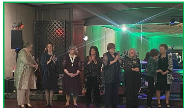
Previous LAOH Hibernians of the Year