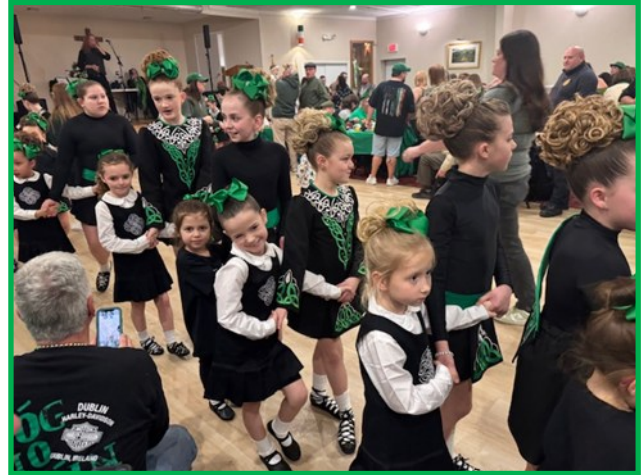
NYC parade down Fifth Avenue.