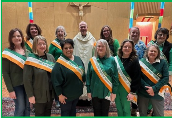
St. Brigid Mass

On February 15, 2025, the Nebraska AOH & LAOH held their annual Awards Banquet where the LAOH presented three awards. Awards winners are pictured (L-R).