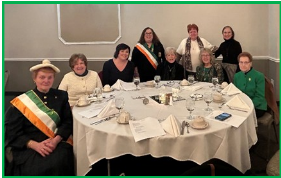
St Brigid Mass