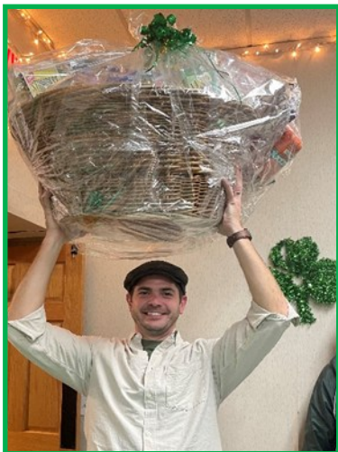
Pictured is the happy winner of the family Basket.