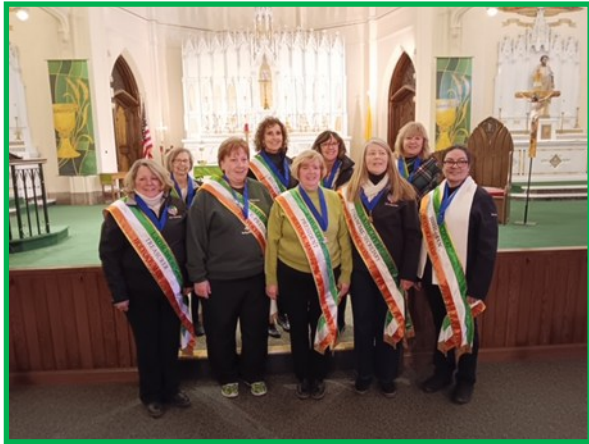
Holyoke Div. 2 newly installed officers