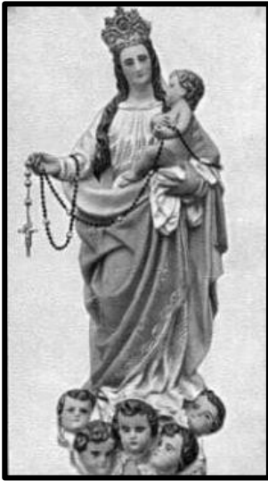
Our Lady of Limerick