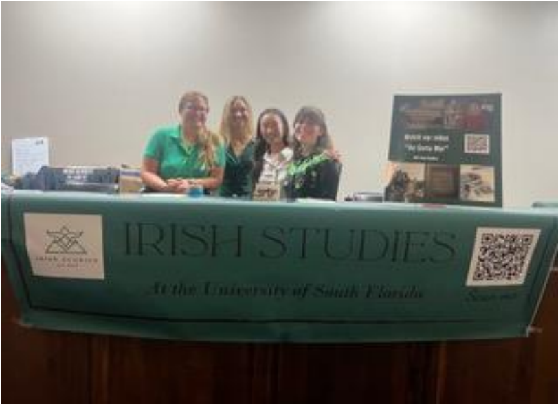
Representing the Irish Studies Group at USF