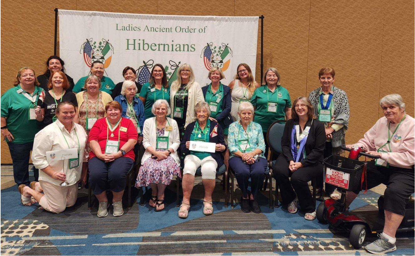
All Florida Members