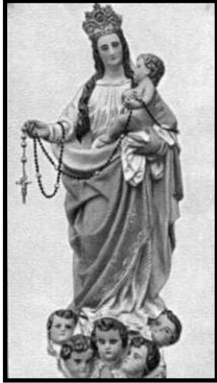
Our Lady of Limerick

State Board, County Board, and Division officers shall be furnished with a copy of the latest Ritual at the State Board, County Board, or Division's expense. The Rituals are the property of the respective officers of the State Board, County Board, and Division and must be transferred to the officer's successor within thirty (30) days of the expiration of her term of office.