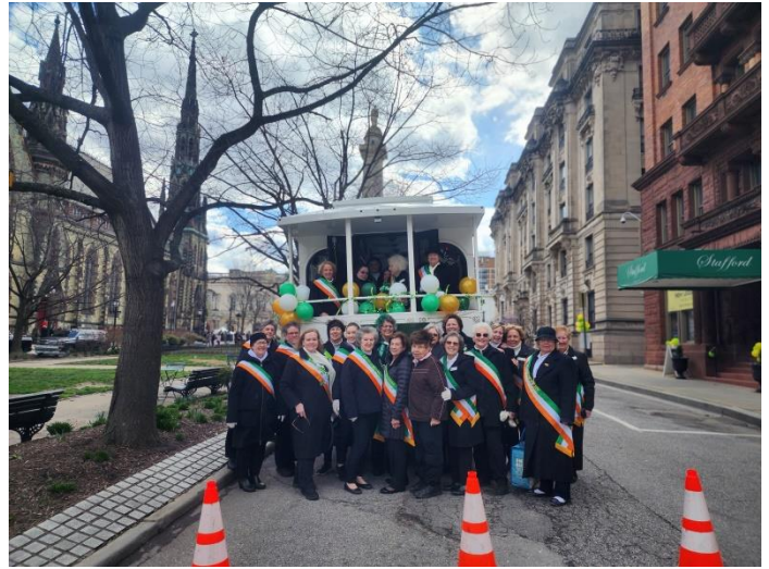
2024 Baltimore St. Patrick's Day Parade

At our April meeting we planned our next fundraiser, we are again doing our Patriotic Wagon Picnic Basket. We are also