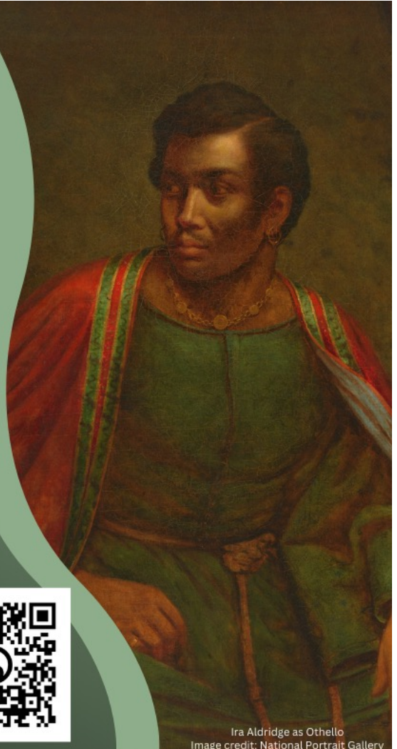
Ira Aldridge as Othello