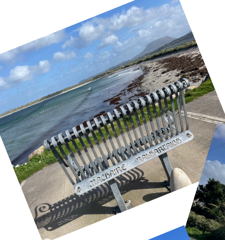
The beach at Gortahork, Donegal.