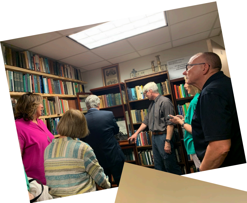
LAOH and AOH members visit USF Irish Studies