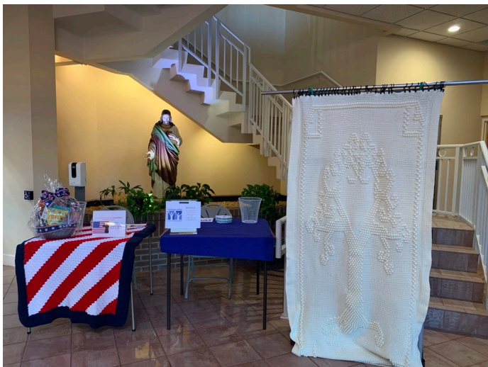
Above, LAOH sponsors a Craft Fair at Prince of Peace. Left – items raffled with proceeds going to local charities