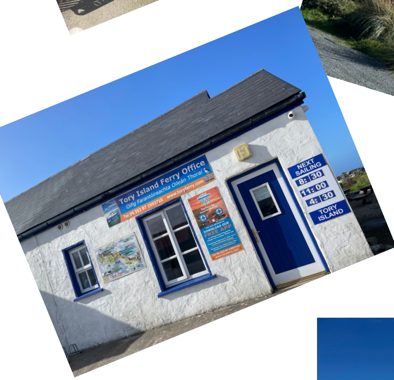
Ferry to Tory Island from Gortahork, Donegal.