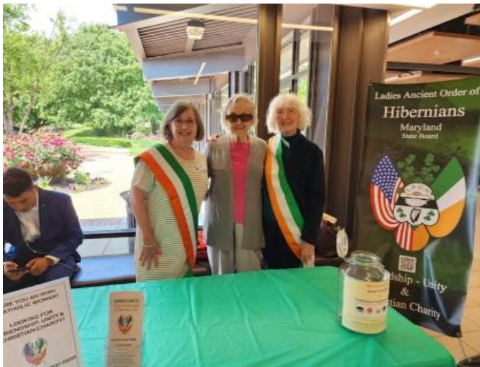
in Howard County.

Our Division is currently in a quiet period while we are on summer hiatus. We ended our second quarter with a very successful Mother's Day baby shower for the Columbia Pregnancy Center held at St. John the Evangelist in Columbia. We were able to donate $1000 in addition to a significant amount of new and used boys' and girls' infants and toddlers clothing, shoes, diapers, toys, stroller and infant care items. We are very grateful for the generosity of the parish and our ability to celebrate life by meeting the needs of our community