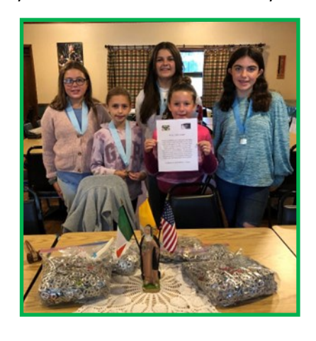
Albany's Junior Division "Daughters of LAOH JFK Division 1" delivered hundreds of pull-tabs to Ronald McDonald House in Albany, following their September meeting