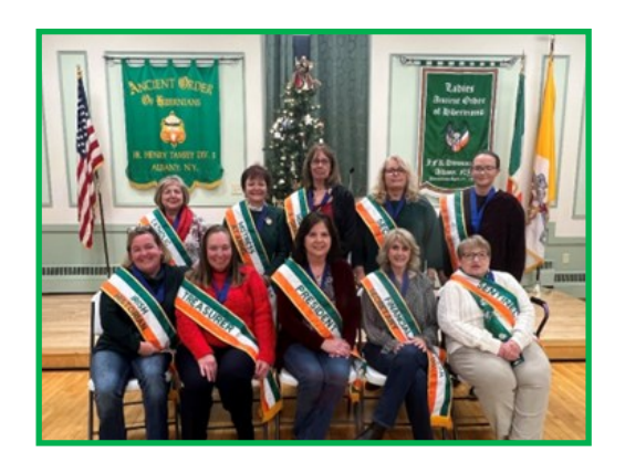
Newly installed Albany LAOH officers