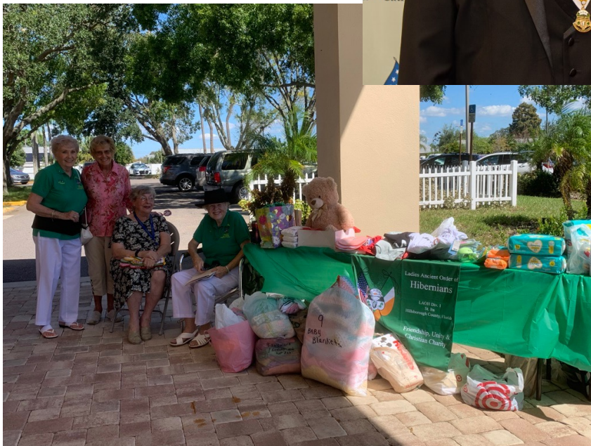
The beginning of the Foundations of Life Baby Shower