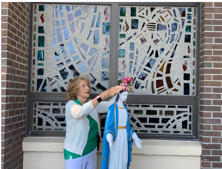
Crowning of Mary Ceremony