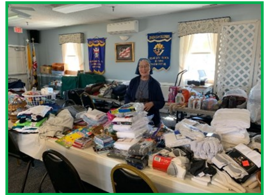
Items collected for Joseph House

Supporting Joseph House for the Homeless, LAOH Worcester County division held an event at the Knights of Columbus Hall for Joseph House for homeless men in the Salisbury area. Our division collected new clothing, underwear, belts. Less worn shoes and items that the nuns had requested. This will become an annual event. Serving our community through God, his love and kindness.