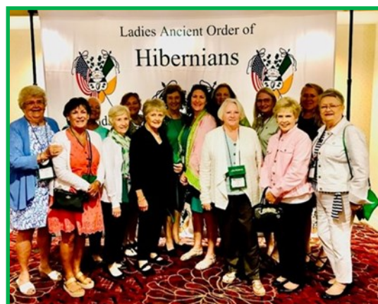
The Indiana LAOH had a wonderful time at the LAOH National Convention in Pittsburgh.