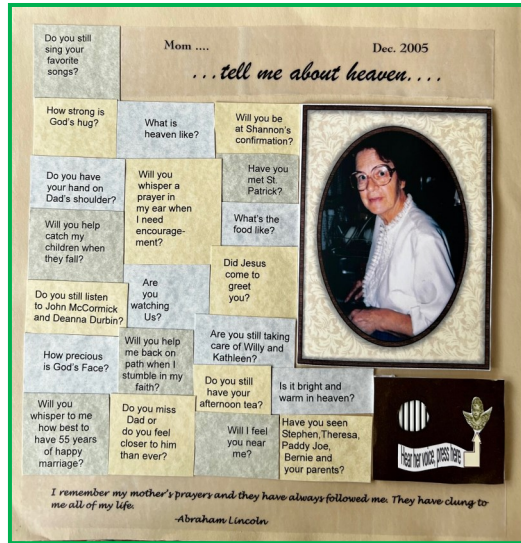
Sample pages from the winning scrapbook