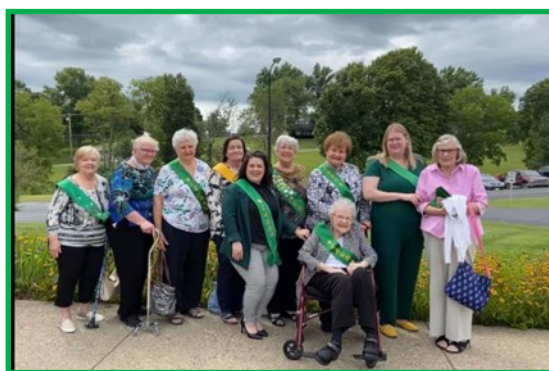
Members of our Lady of Knock Division- 2022