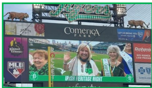
Hibernian Ladies enjoying the time at the Tiger game