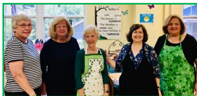
Community Service activities from July 2022