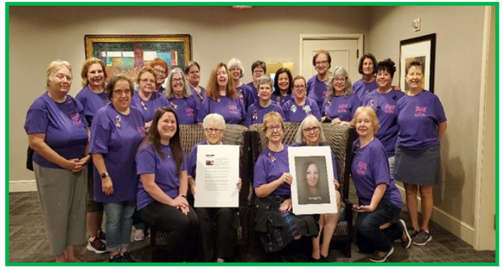
LAOH Members attending the Spirit of St Brigid service project in Pittsburgh

Thank You to all the Charity sponsors, as usual the LAOH is very generous.