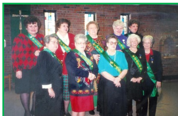
Our Lady of Knock Division 10 th Anniversary Photo - 2002