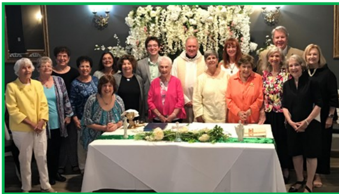
LAOH members and guests

Fellowship was the order of the day with all in attendance socializing and visiting after being unable to do so for so long because of all the COVID restrictions. Our thanks to God for things being back to a new normal.