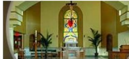
St. Patrick's Church

Mass will be at 11:00 a.m. on Sunday August 21 th at St. Patrick's Church in Taylor Mill, KY. Wear your sash.