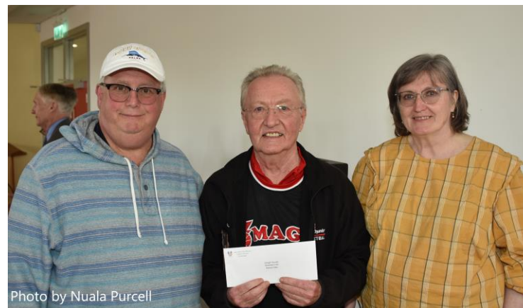
Omagh Thunder Basketball