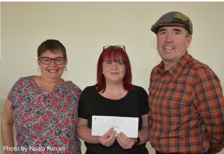
Duchas Oiriall - South Armagh