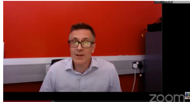
St. Patrick's Center, Downpatrick