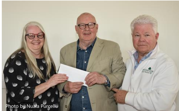
National Graves Association, Belfast