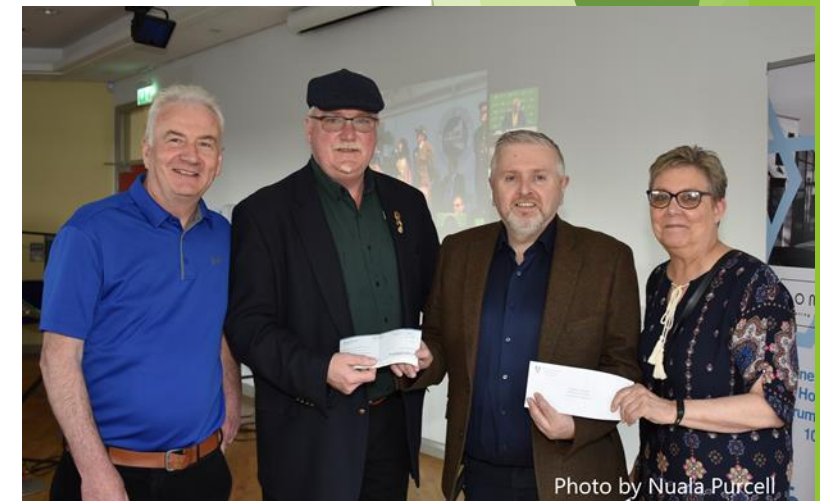
The Passionist Peace and Reconciliation Office (Holy Cross)