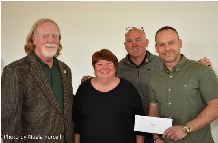
Bridges Beyond Boxing, Belfast