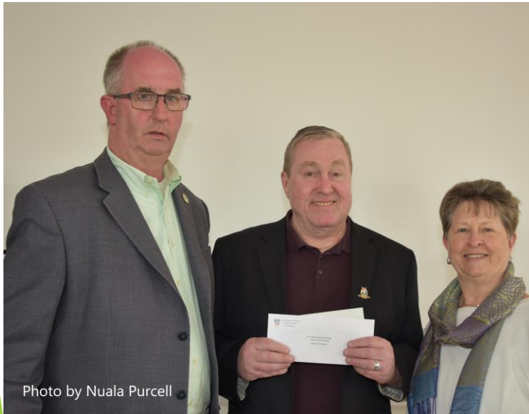
Greater New Lodge Cultural Society