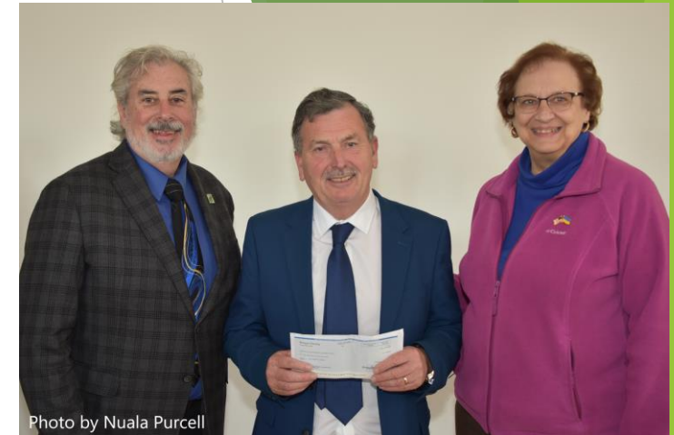
Ballymurphy Families Committee