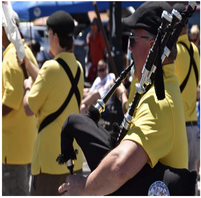
Happy Summer Everyone!