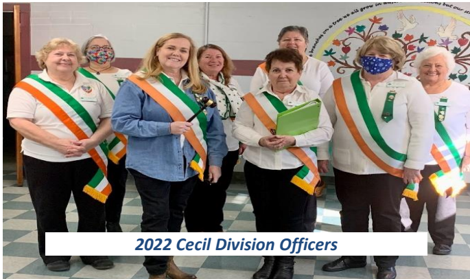
2022 Cecil Division Officers

Our Book Club met to discuss The Cottingly Secret and When We Were Young and Brave , by Hazel Gaynor, Angels in my Hair ,