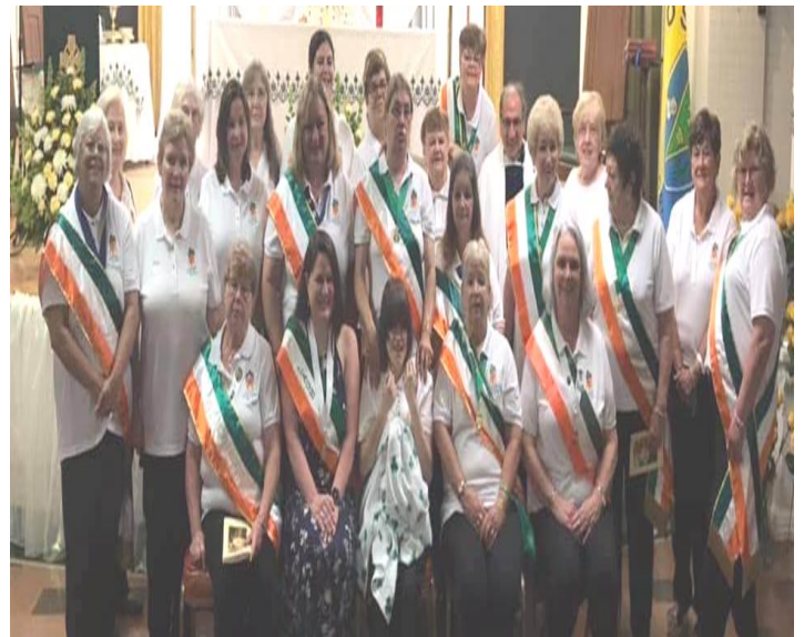
Division 2 Notre Dame Montgomery County