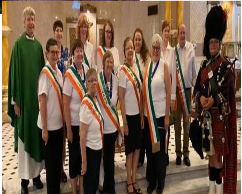
Division One Lehigh Valley