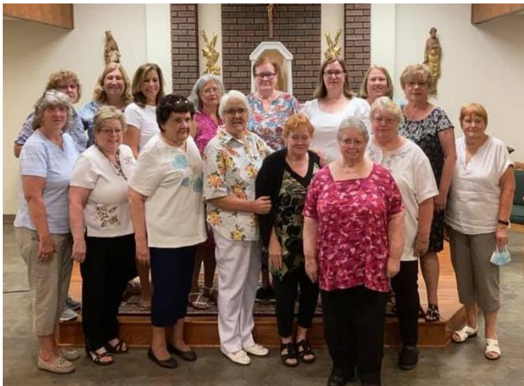
Division 4 Trinity Delaware County