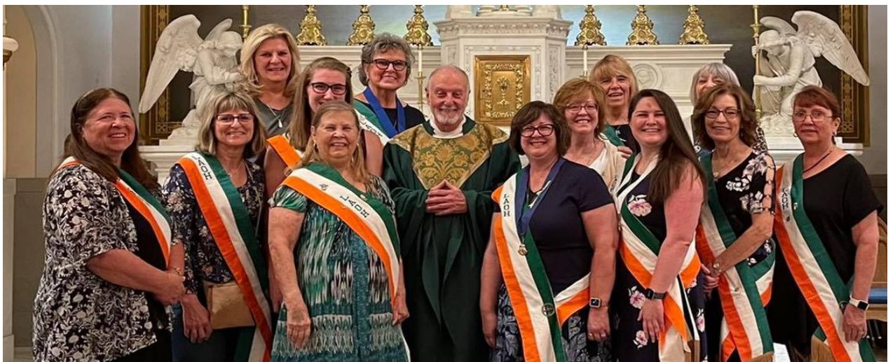
Division One ~ Bristol