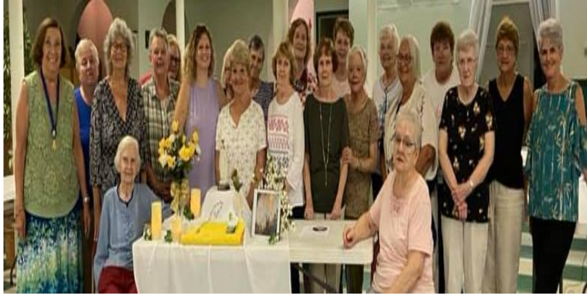
Division 3~ Carbondale