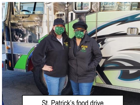
St. Patrick's food drive

We also helped the AOH in Port Richmond with their toy drive and again in March with their food drive. Most recently, we had an online basket raffle, which was very successful and will help with all of our Spring donations.