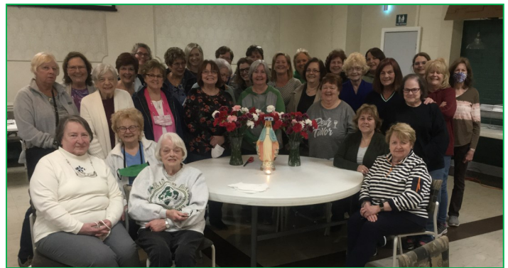
Pictured are some of the members of the Rose Kennedy Division, Wayne County Michigan following the May Crowning at their monthly meeting.