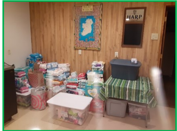
LAOH JFK Division 1 Albany division and junior members and some of the many items donated to Community Maternity Services

Community Maternity Services provides a continuum of services for children, families and pregnant and parenting adolescents throughout the Diocese of Albany including care for mothers and their families; group residence and family care for children; prevention services and supports for families at risk; and daycare services, adoption services, foster care services and respite services.