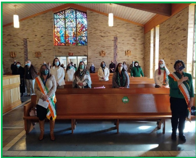
Monroe County NY, Division 1 and 4 LAOH members at the St Patrick's Day Mass