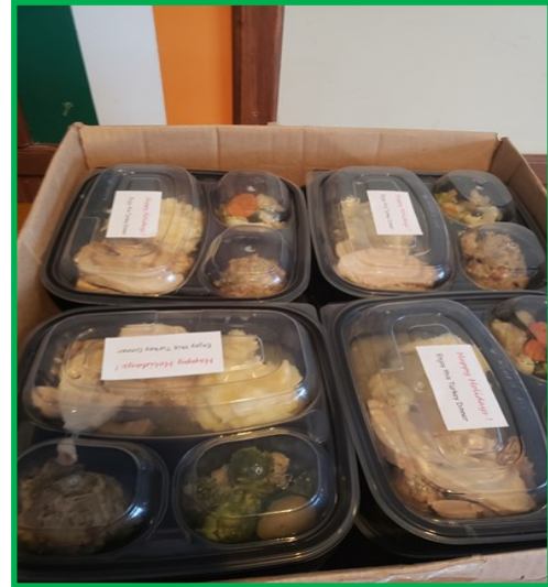
Turkey dinners boxed and ready to go to those in need

In January, the LAOH collected 15 complete 'dinner for 4' bags. These included everything needed for tuna casserole, chili, and chicken and biscuits dinner. They also made and delivered 40 containers of turkey and rice soup.