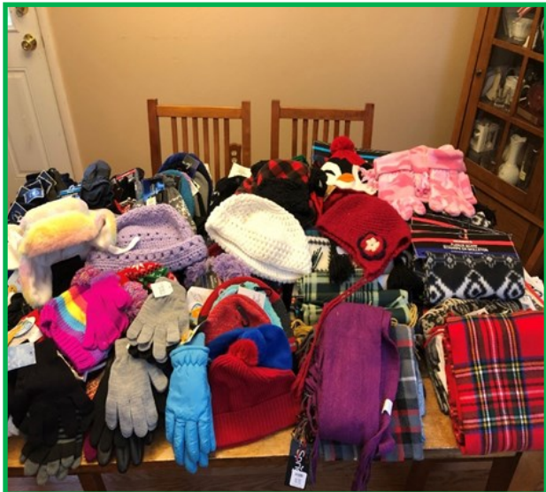
JFK Division 1, Albany, NY items collected