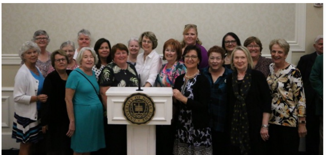
Members of the Ladies Ancient Order of Hibernians who attended the Hibernian Lecture and Dinner.