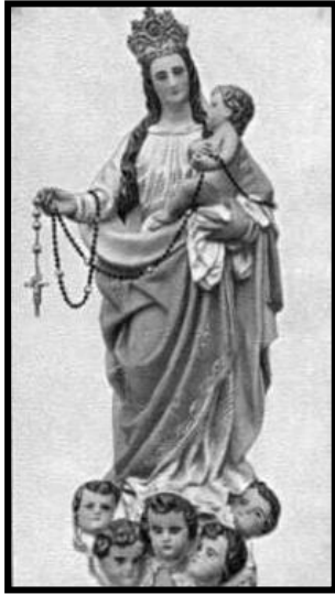
Our Lady of Limerick

State Board, County Board, and Division officers shall be furnished with a copy of the latest Ritual at the State Board, County Board, or Division's expense. The Rituals are the property of the respective officers of the State Board, County Board, and Division and must be transferred to the officer's successor within thirty (30) days of the expiration of her term of office.